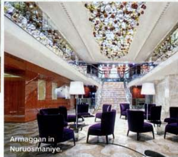
Armaggan in Nuruosmaniye.