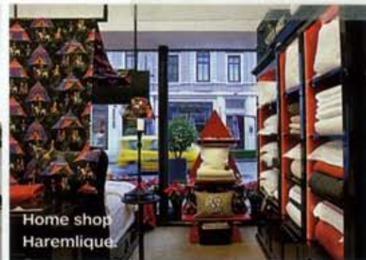
Home shop Haremliques.