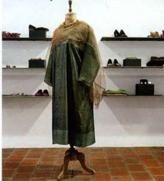
Fashion boutique Gönül Paksoy.